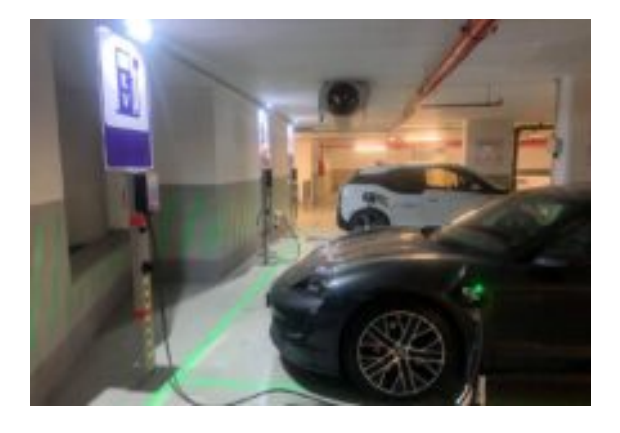
AUTOMOBILES ELECTRICITY ENERGY TRANSPORTATION Rise of Electric Cars in Armenia: What's Driving Their Popularity?